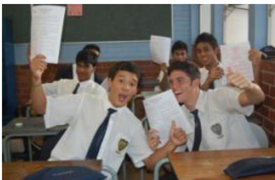
Enthusiastic Olympiad entrants!