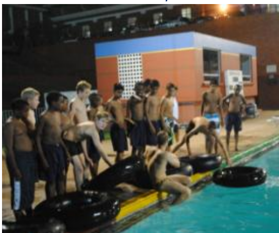
We had great fun at the Camp Out!