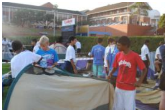
The Tents go up at the Grade 8 Camp Out