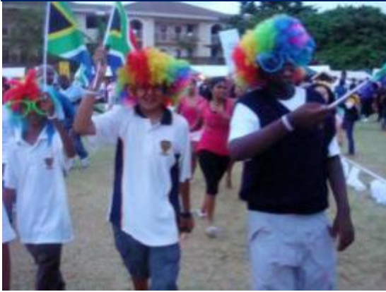
2010 Themed lap at the CANSA Relay