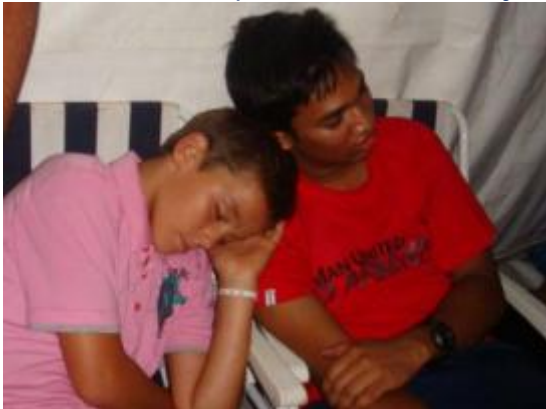
Trying to catch a snooze at 04h40