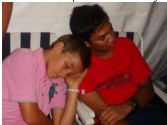
Trying to catch a snooze at 04h40