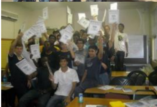
A group of Grade 11s interested in engineering spent the day with Dormac