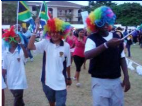
2010 Themed lap at the CANSA Relay