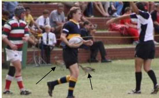
The DHS Geese join in the Rugby vs KES, playing with the 2 nd XV and supporting the 1 st XV