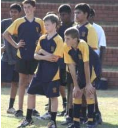
U14 Rugby players watched enthralled as they learn from their heroes from the 1 st XV at the U14 Rugby Camp last term