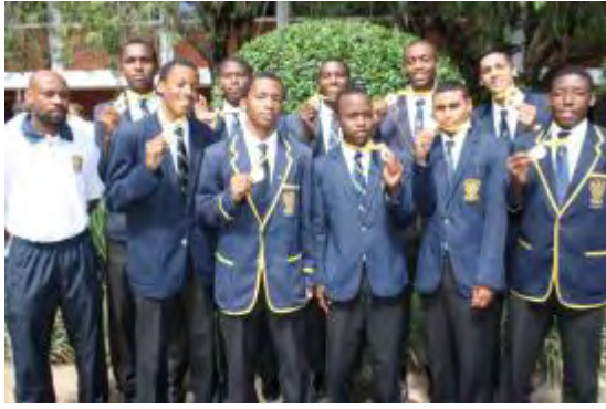
The 1 st Basketball Team hold up the gold medals they brought home from the St John's College Basketball Tournament