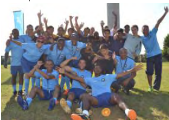
Durban High School's U15 soccer team with coaches from all over KwaZulu Natal for the Royal Netherlands Football Association (KNVB) workshop

The programme is aimed at developing the skills of coaches in South Africa in order to equip them with the knowledge of teaching the youth the Dutch technique of football.