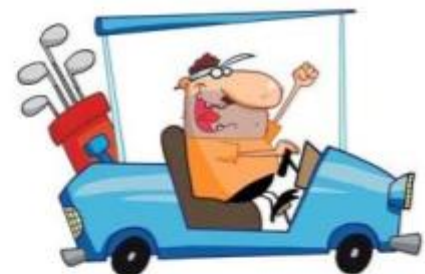
Dale McDermott Golf Day