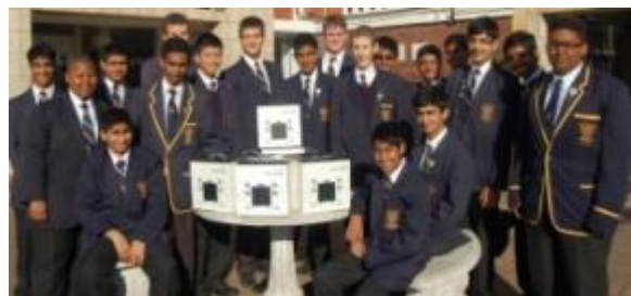
Congratulations to the 2 teams of DHS learners who were placed joint 3 rd at the HIP2B 2 I Think 2011 Challenge