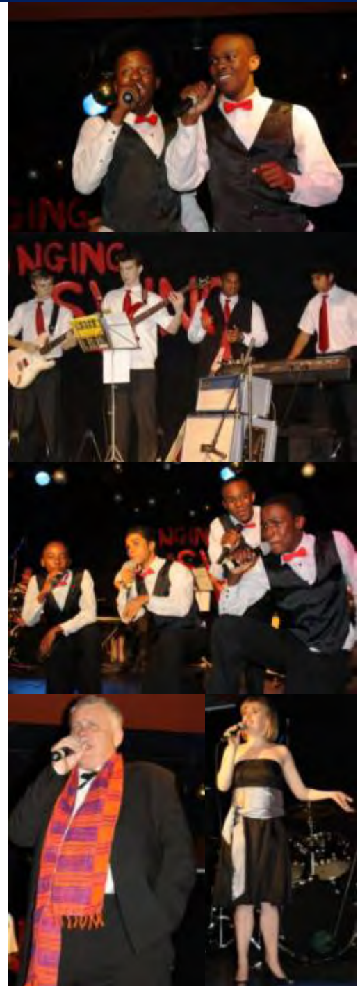
The Cast of Singing Swing in action

Player of the tournament. He will now go to Cape Town to attend a training camp with Paul Treu (Springbok 7's Coach) all expenses paid by @lantic.