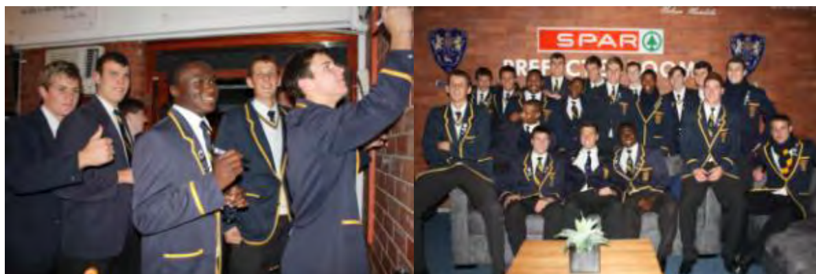
The Prefects autograph the wall in the new Prefects' Room (far left)