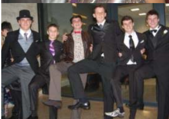
Photos taken at the Matric Dance