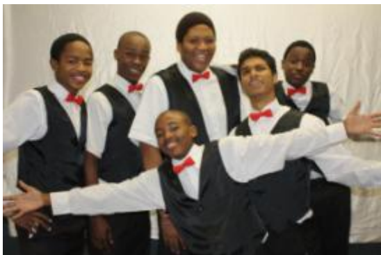
Members of the Singing Swing cast get down to business

He will now perform in a gig at the Westville Fair this weekend. Congratulations to our rising star!