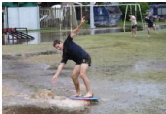
The Boarders having fun on the water logged fields at DHS.