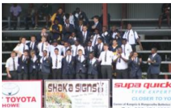
Cheering the 1 st XV on in Eshowe.