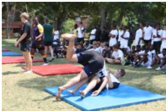
The Rugby boys learn some judo moves to incorporate into their tackling at Eshowe.