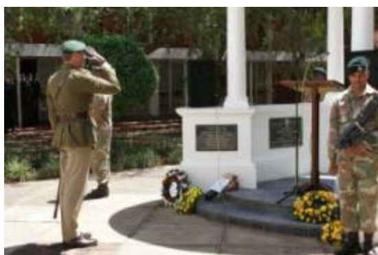
Lt Colonel Greg de Ricquebourg lays a wreath in memory of all those killed in war