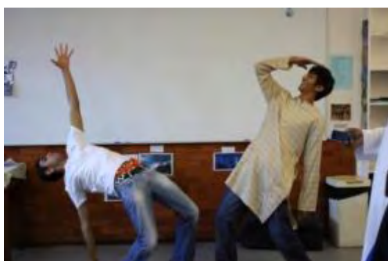
What a fun day! Elegant outfits, delicious food and music and dancing in the classroom! Please can we do it again, Sir?

problem children were conspicuous by their absence.