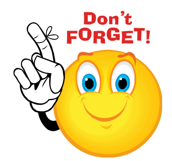
International Coastal Cleanup

Saturday 18 September from 09h00 to 11h00 is Coastal Cleanup day.