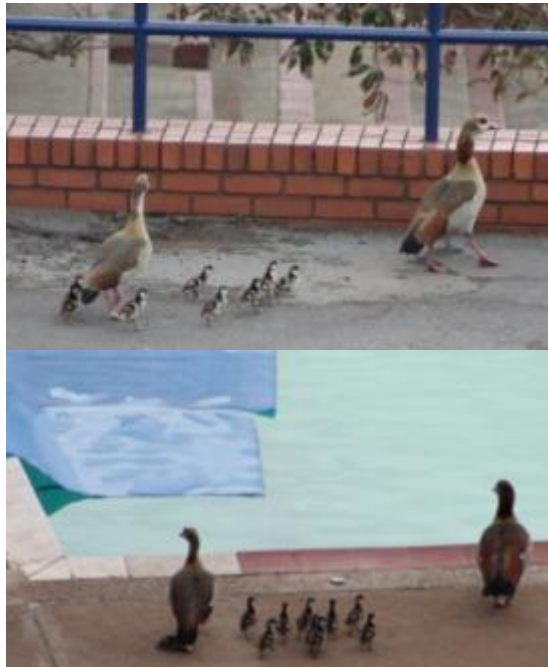
Our resident Mom and Dad Egyptian Geese make their way through the car park and down to the pool to introduce their new babies to the water for the first time.