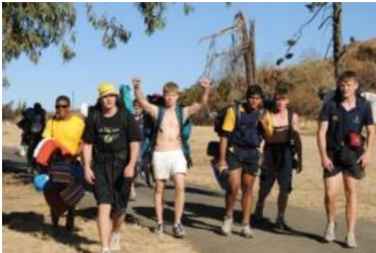
Yes! We made it!