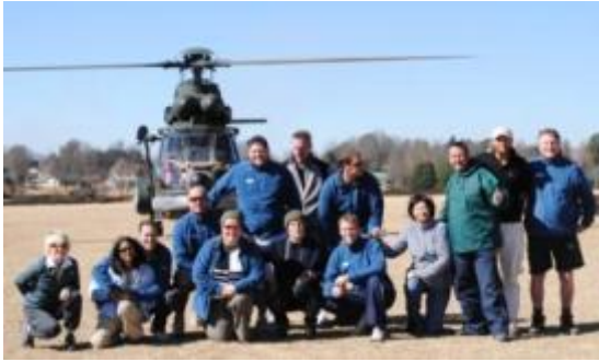
DHS Staff were lucky enough to be taken for a helicopter flip by the SAAF while at Cobham