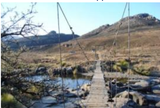
The beauty of Cobham