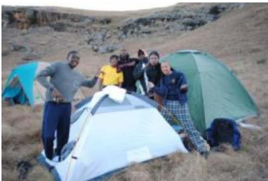
Setting up Camp in the mountains