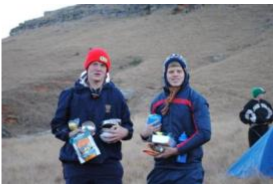
What's for supper?