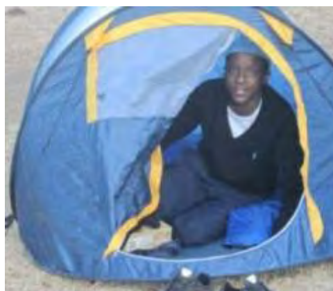
More Cobham fun!

At the end of the day, our lads weren't placed. However, what better event to be involved in on Madiba's birthday and we thank everyone from DHS who participated for their time and commitment on a Sunday!