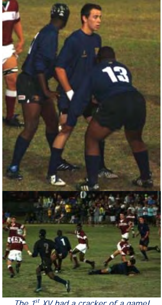
The 1<sup>st</sup> XV had a cracker of a game!