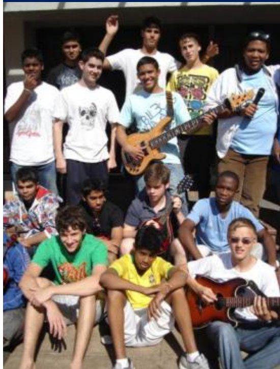
The Cast of the Magical Mystery Tour