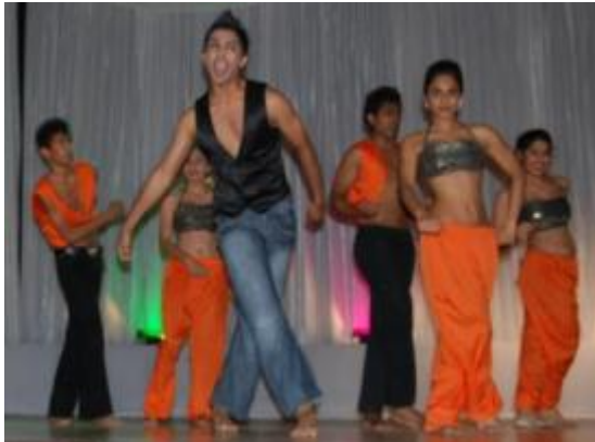
The DHS boys dance with the beautiful girls.